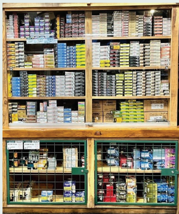
Display and storage using toughened glass example