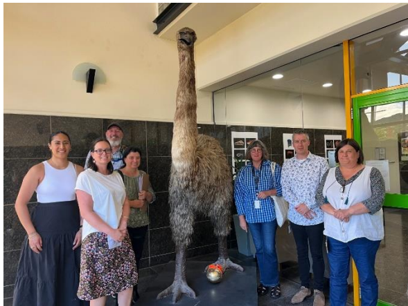
Photo of Te Tari Pūreke and Te Papa staff.

You can follow this link to participate.